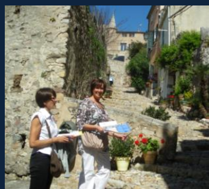
Climbing stairways in the old town