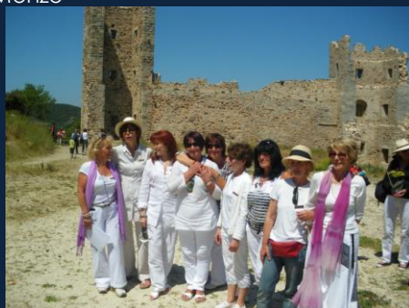
Agora Club Hyères

After a spectacular walk on the cliffs on Saturday, we started early on Sunday for a 5-hours walking rally that took the participants around the beautiful town of Hyères, an absolutely lovely old town filled with history, beautiful architecture, spectacular views and romantic parks. We had to solve questions, find clues to pass checkpoints (where we had to perform some fun tests like juggling, pingpong etc), dig into the history to finally end up high above Hyères on the ruins of the old castle where a lovely picnic awaited us. The whole day was perfectly organized with a good balance of culture, fun and sport. Congratulations to the whole team of Agora Club Hyères!!